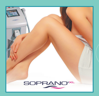
Laser Hair Removal